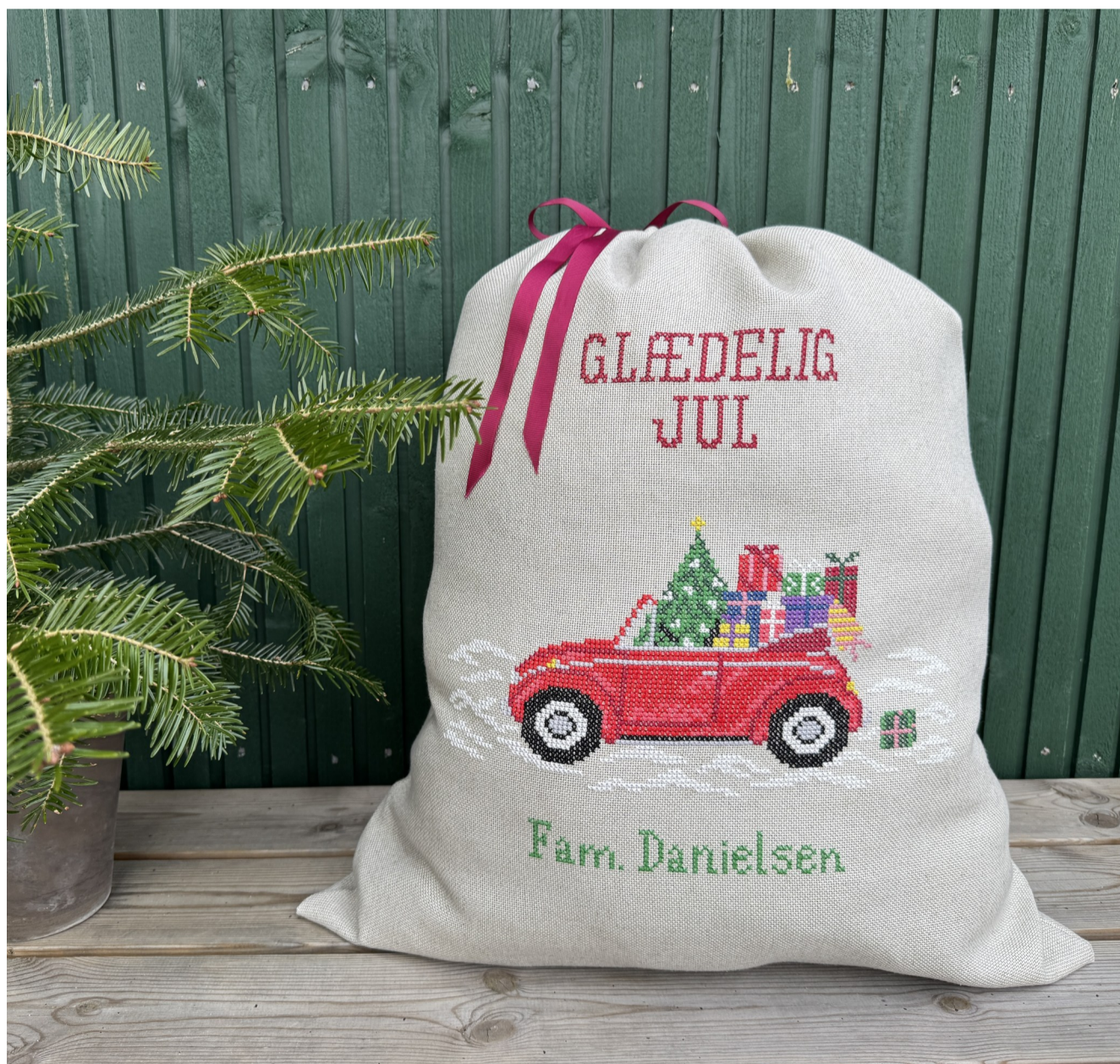
2036-3 52 x 67 cm 7threaded Floba (33% linen - 67% viscose)