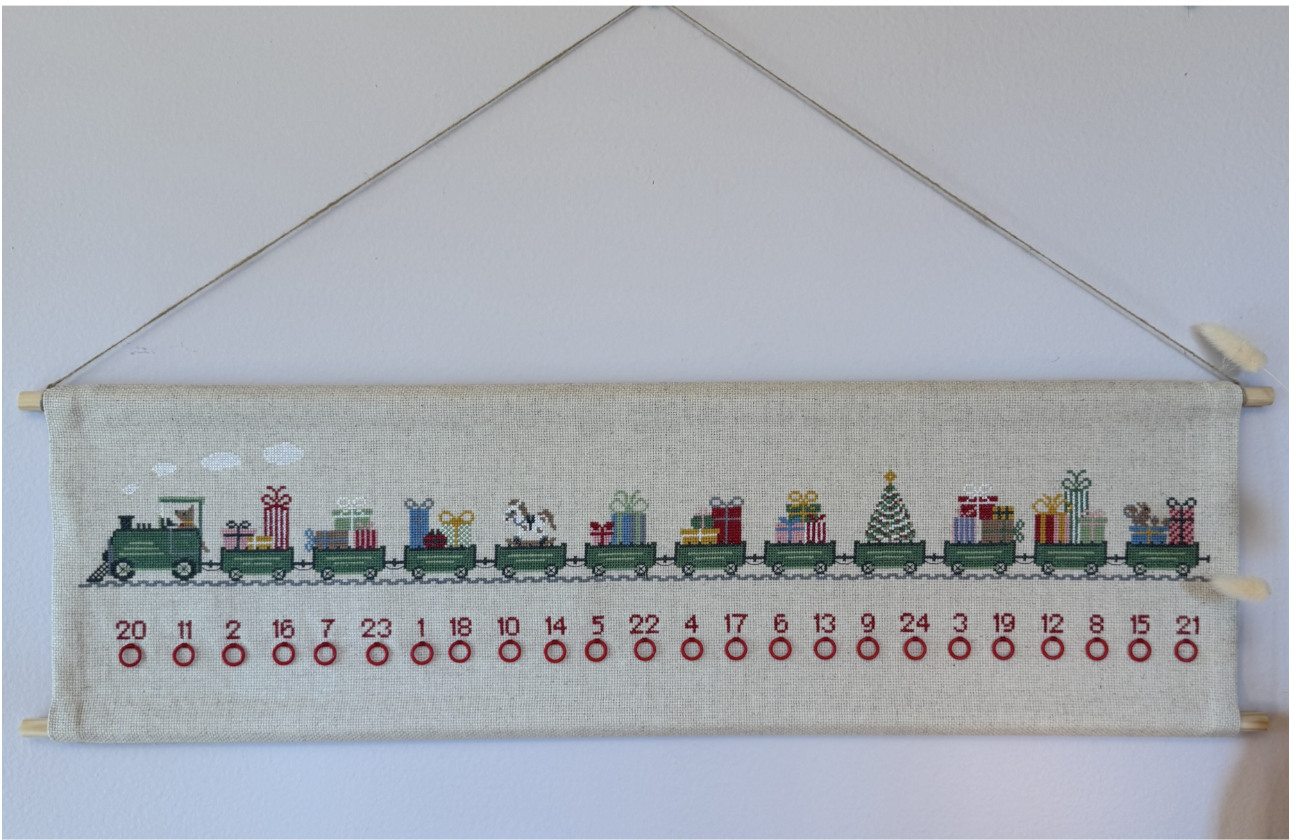
2039-8 25 x 80 cm 5,4 aida (20% linen - 80% cotton)