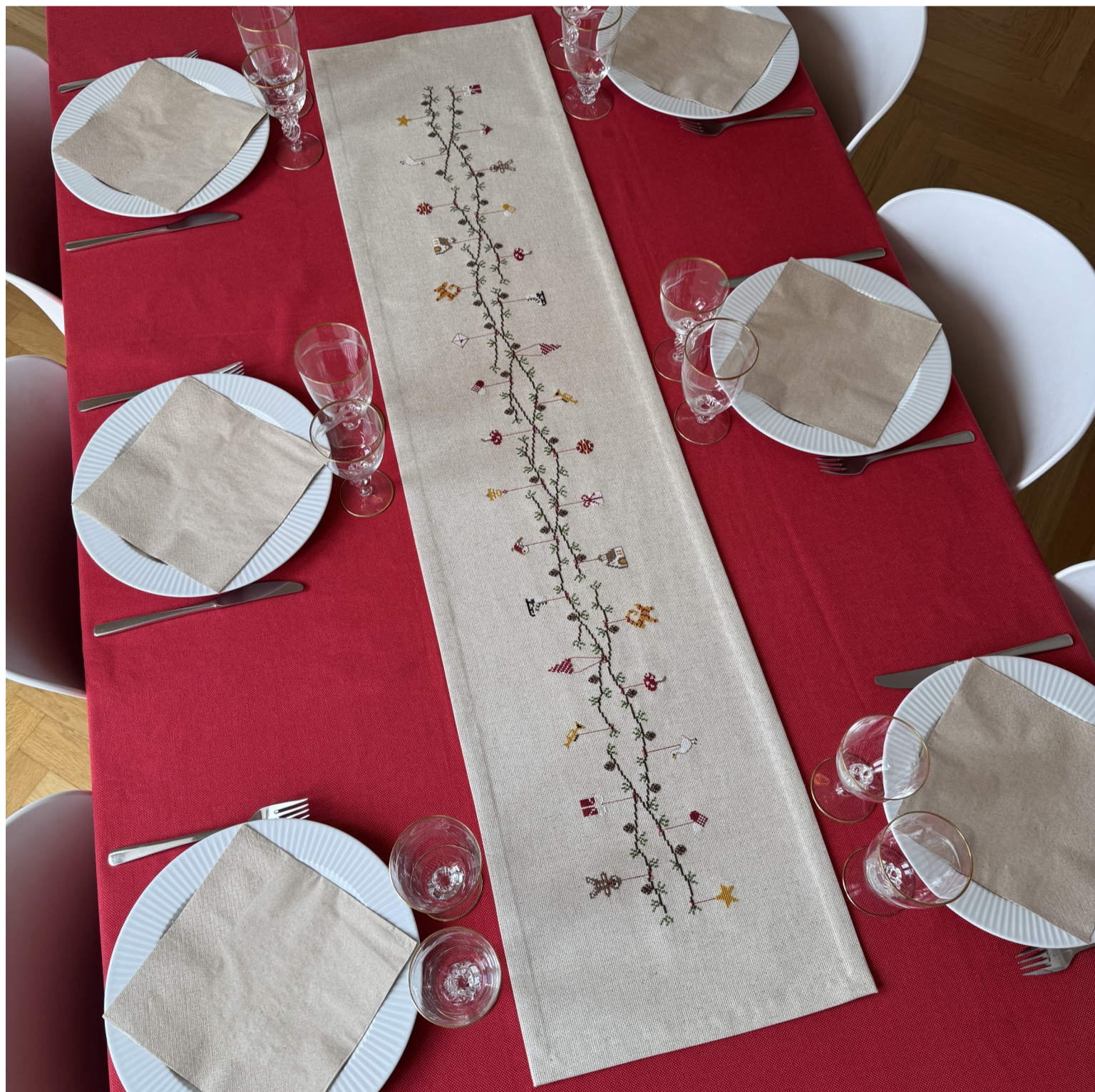
2030-5 32 x 130 cm 5,4 aida (20% linen - 80% cotton)