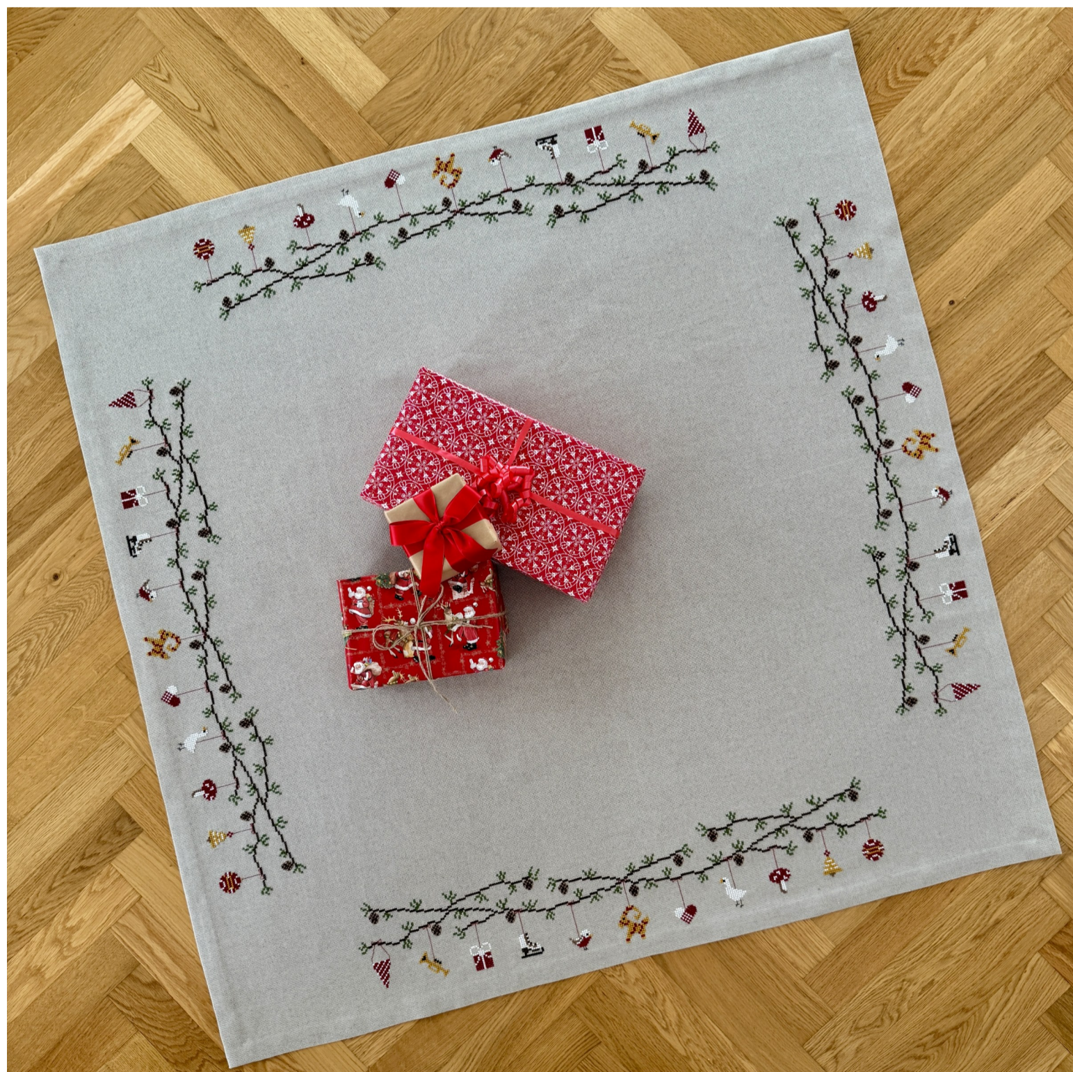
2028-11 128 x 128 cm 7threaded Floba (33% linen - 67% viscose)