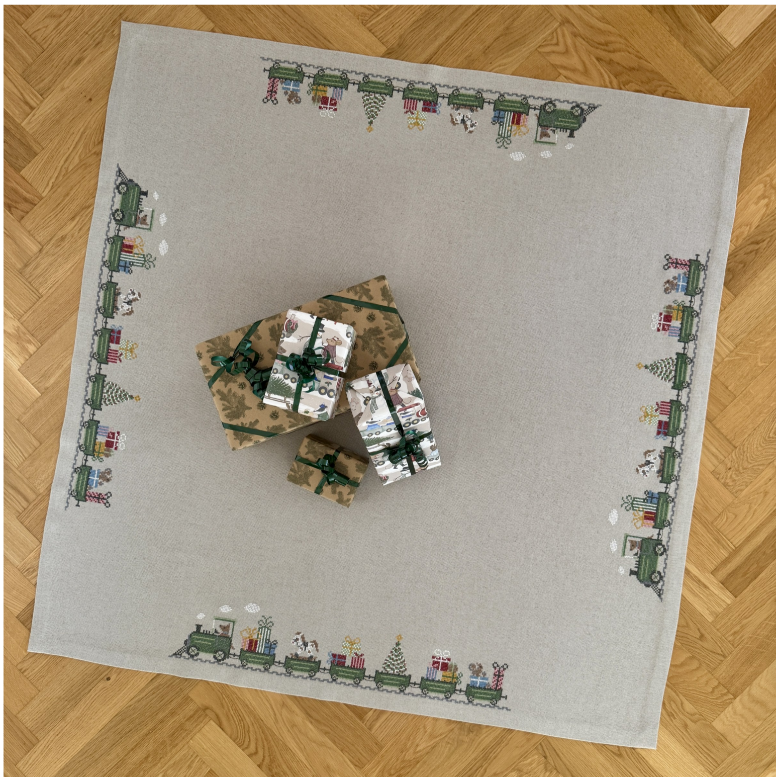
2028-10 128 x 128 cm 7threaded Floba (33% linen - 67% viscose)