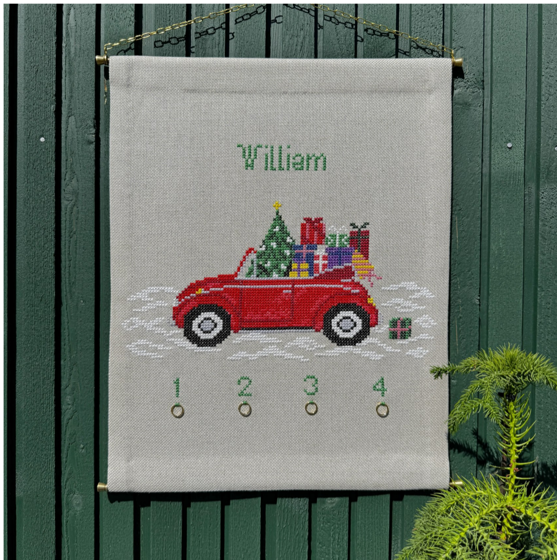
2039-9 35 x 45 cm 7threaded Floba (33% linen - 67% viscose)