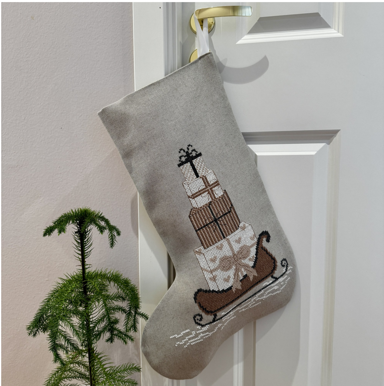
2037-5 52 x 37 cm 7threaded Floba (33% linen - 67% viscose)