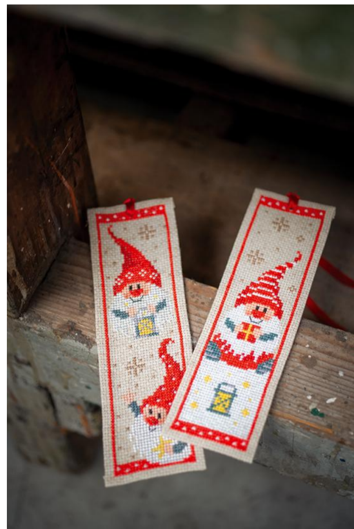
Kit PN0185073 ca. 4x24 cm x2, Aida 5,4 60% polyester, 40% linen, Thread: DMC mouline 100% cotton