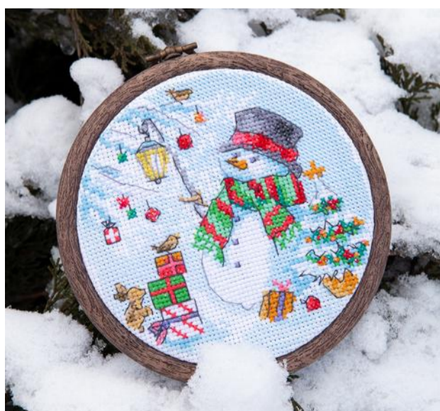
Kit PN0215511 ca. Ø12 cm, Aida 5,4 100% cotton, Thread: 100% cotton