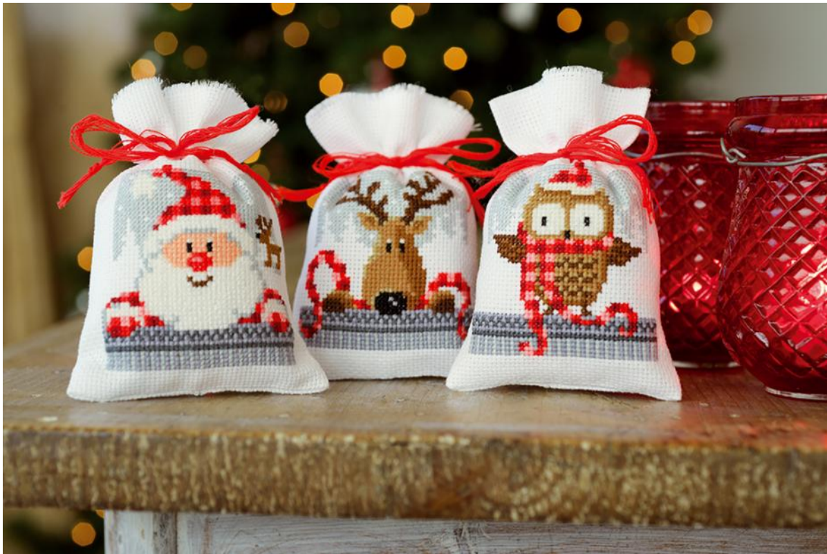
Kit PN0149462 ca. 8x12 cm x3, Aida 7,0 100% cotton, Thread: DMC mouline 100% cotton