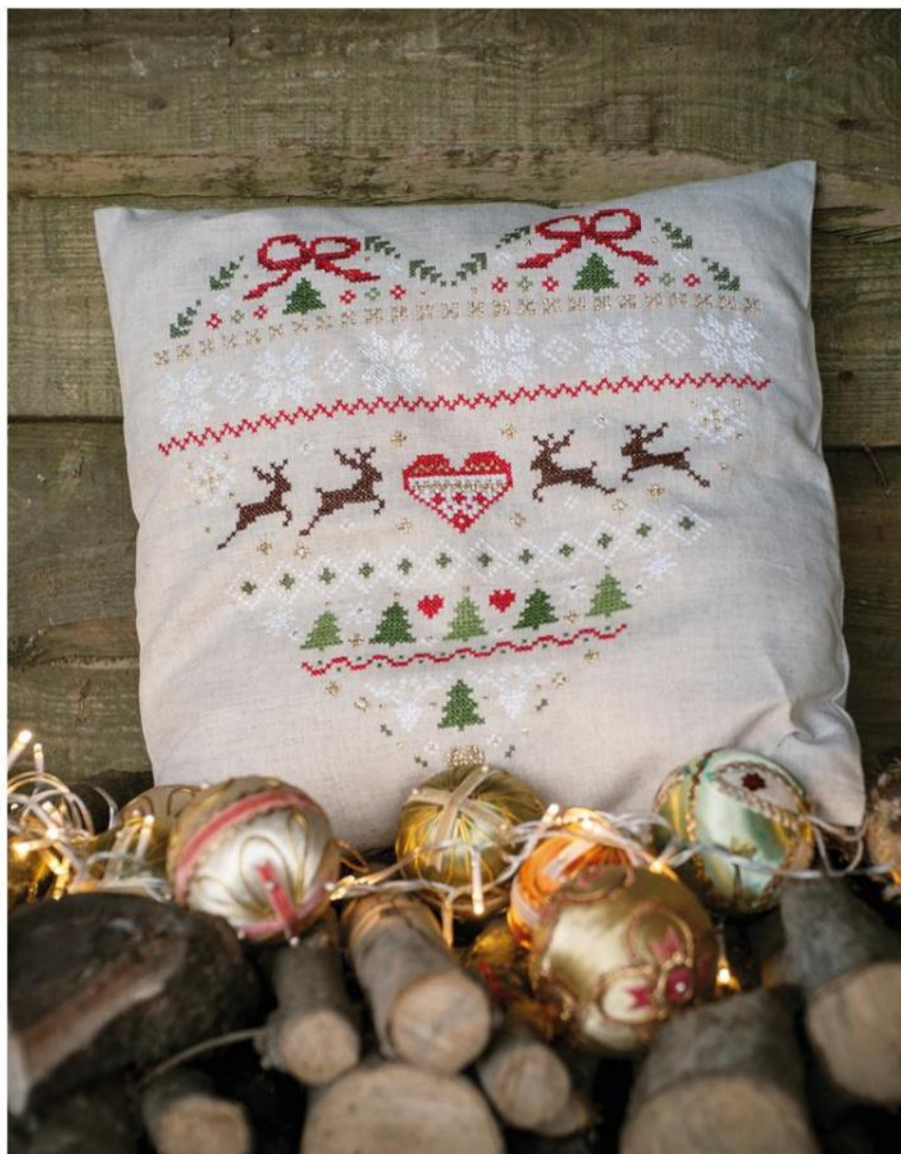
Kit PN0219159 ca. 40x40 cm, Påtegnnet 1050% cotton, Thread: DMC mouline 100% cotton