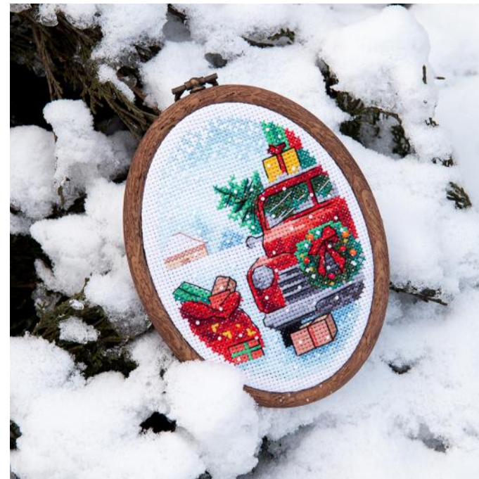
Kit PN0215513 ca. 10x14 cm, Aida 5,4 100% cotton, Thread: 100% cotton