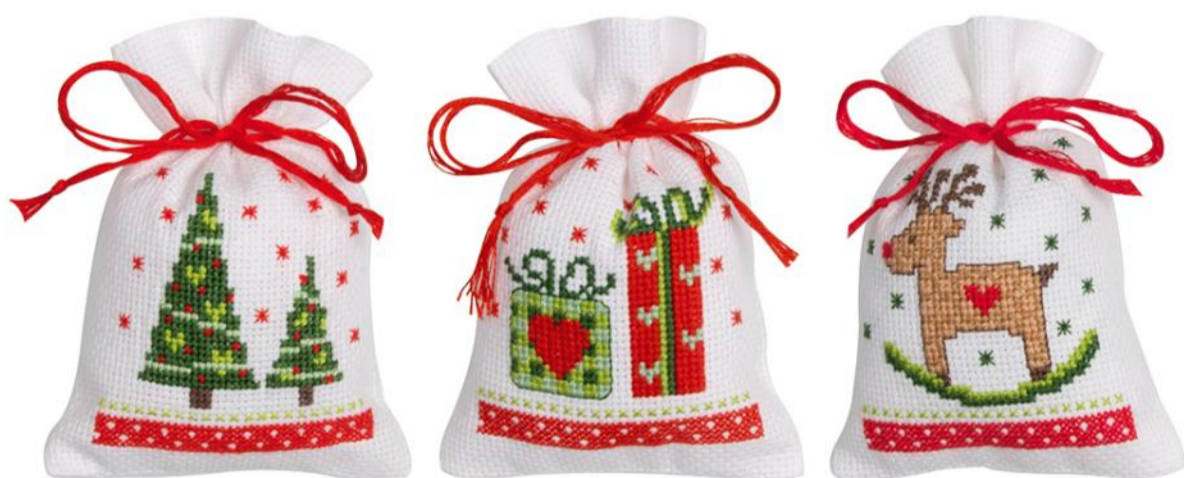
Kit PN0188100 ca. 8x12 cm x3, Aida 7,0 100% cotton, Thread: DMC mouline 100% cotton