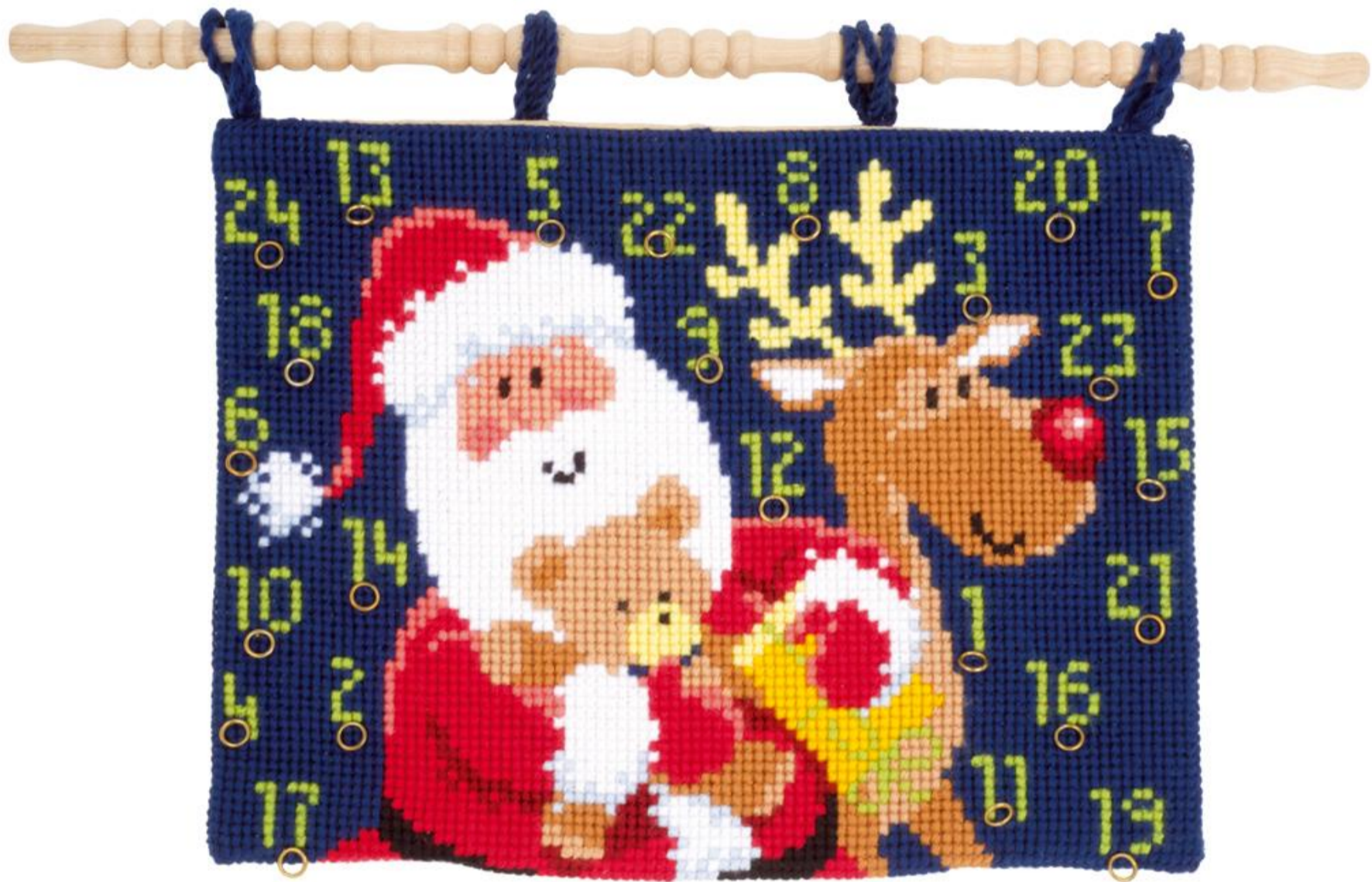
Kit PN0147684 ca. 53x40 cm, Canvas 1,8 100% cotton, Thread: 100% acrylic,