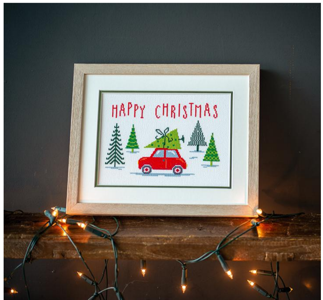
Kit PN0166321 ca. 25x17 cm Aida 5,4 100% cotton, Thread: DMC mouline 100% cotton