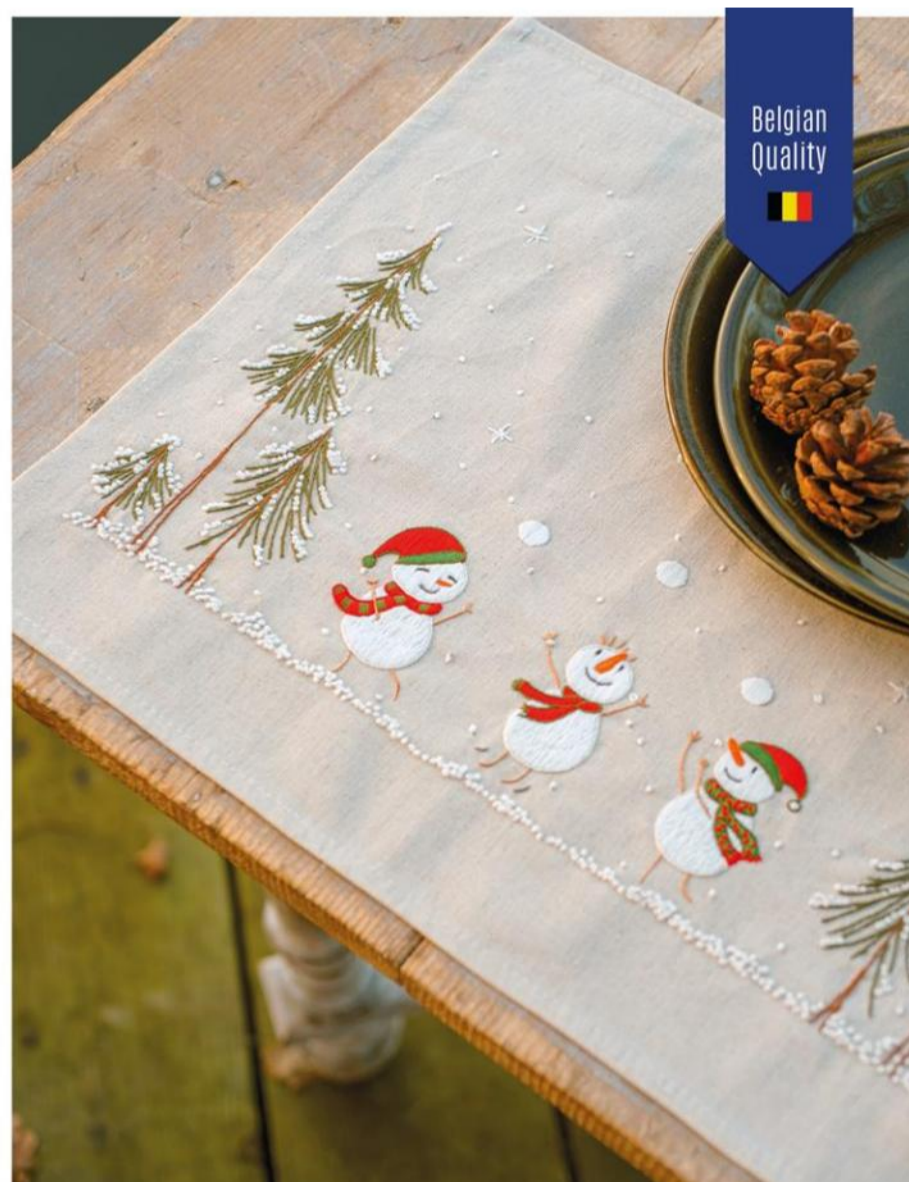
Kit PN0223168 ca. 35x45 cm x2, Påtegnnet 50% cotton 50% linen, Thread: DMC mouline 100% cotton