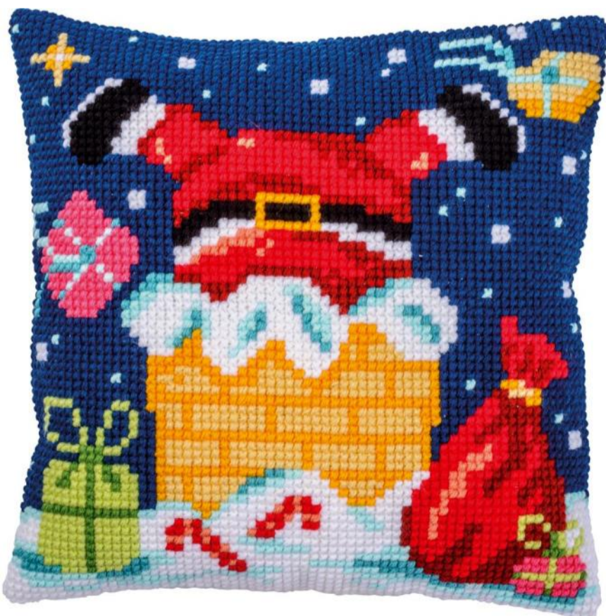
Kit PN0206946 ca. 40x40 cm, Canvas 1,8 100% cotton, Thread: 100% acrylic,