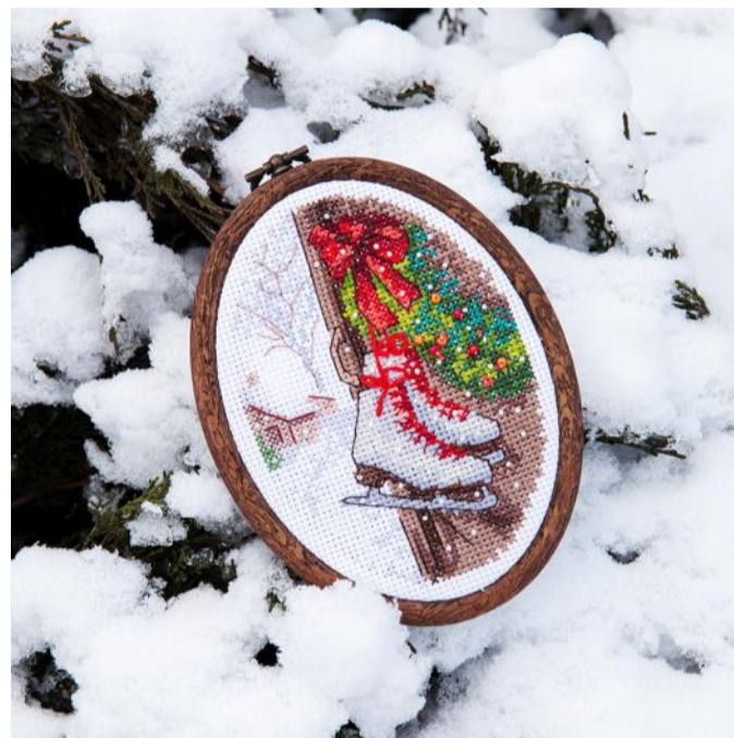
Kit PN0215514 ca. 10x14 cm, Aida 5,4 100% cotton, Thread: 100% cotton