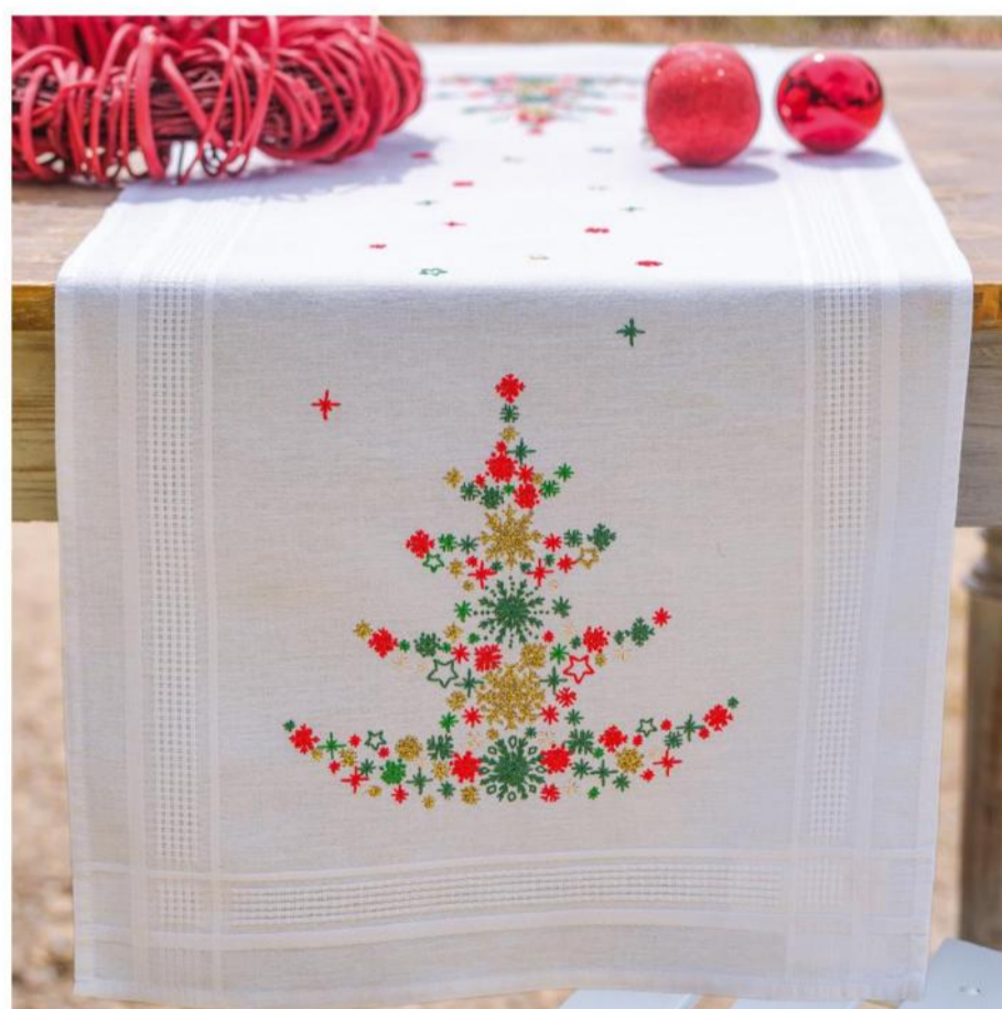
Kit PN0218373 ca. 40x100 cm, Påtegnat 100% cotton, Thread: DMC mouline 100% cotton