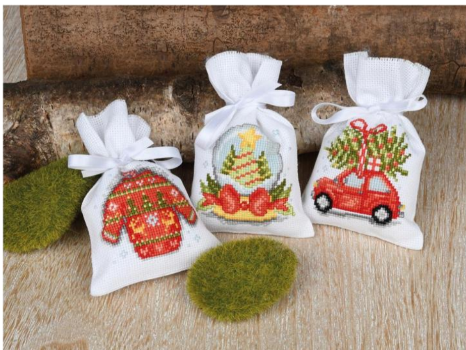
Kit PN0203553 ca. 8x12 cm x3, Aida 7,0 100% cotton, Thread: DMC mouline 100% cotton