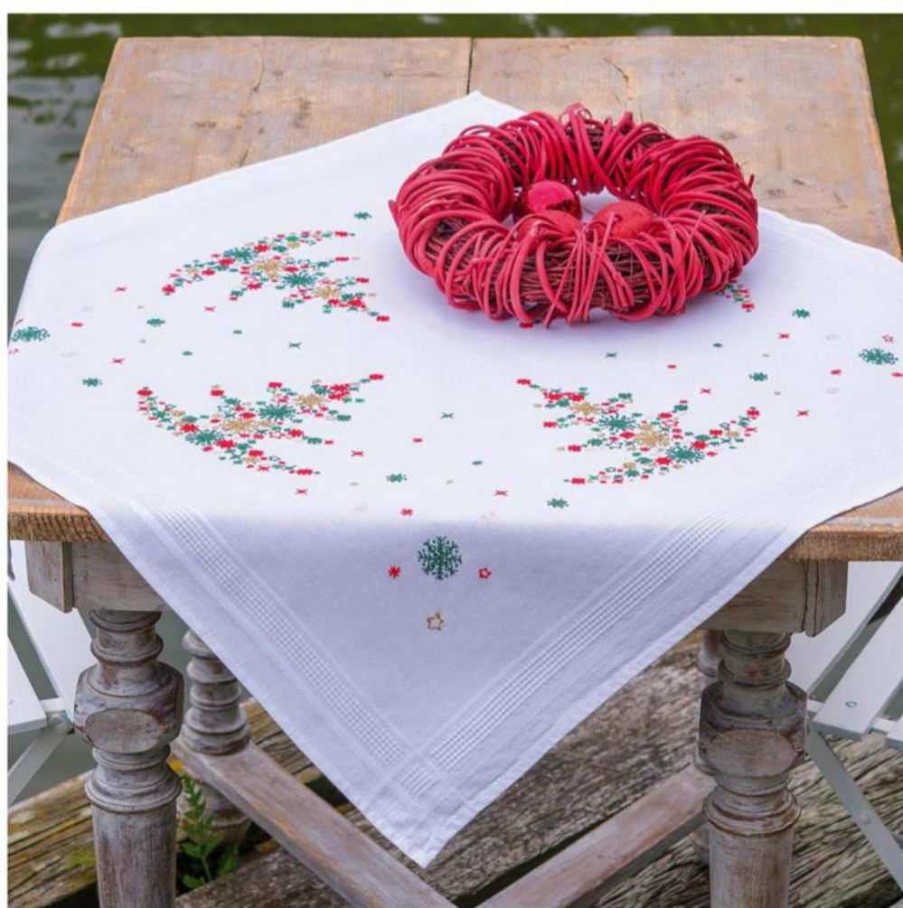
Kit PN0227467 ca. 80x80 cm, Påtegnat 100% cotton, Thread: DMC mouline 100% cotton