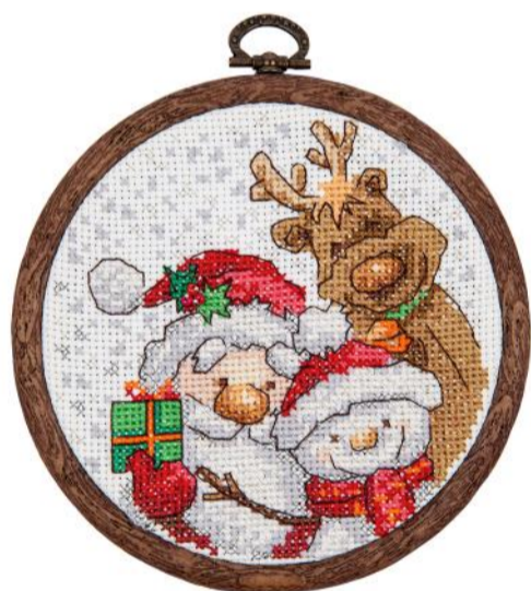
Kit PN0215512 ca. Ø12 cm, Aida 5,4 100% cotton, Thread: 100% cotton