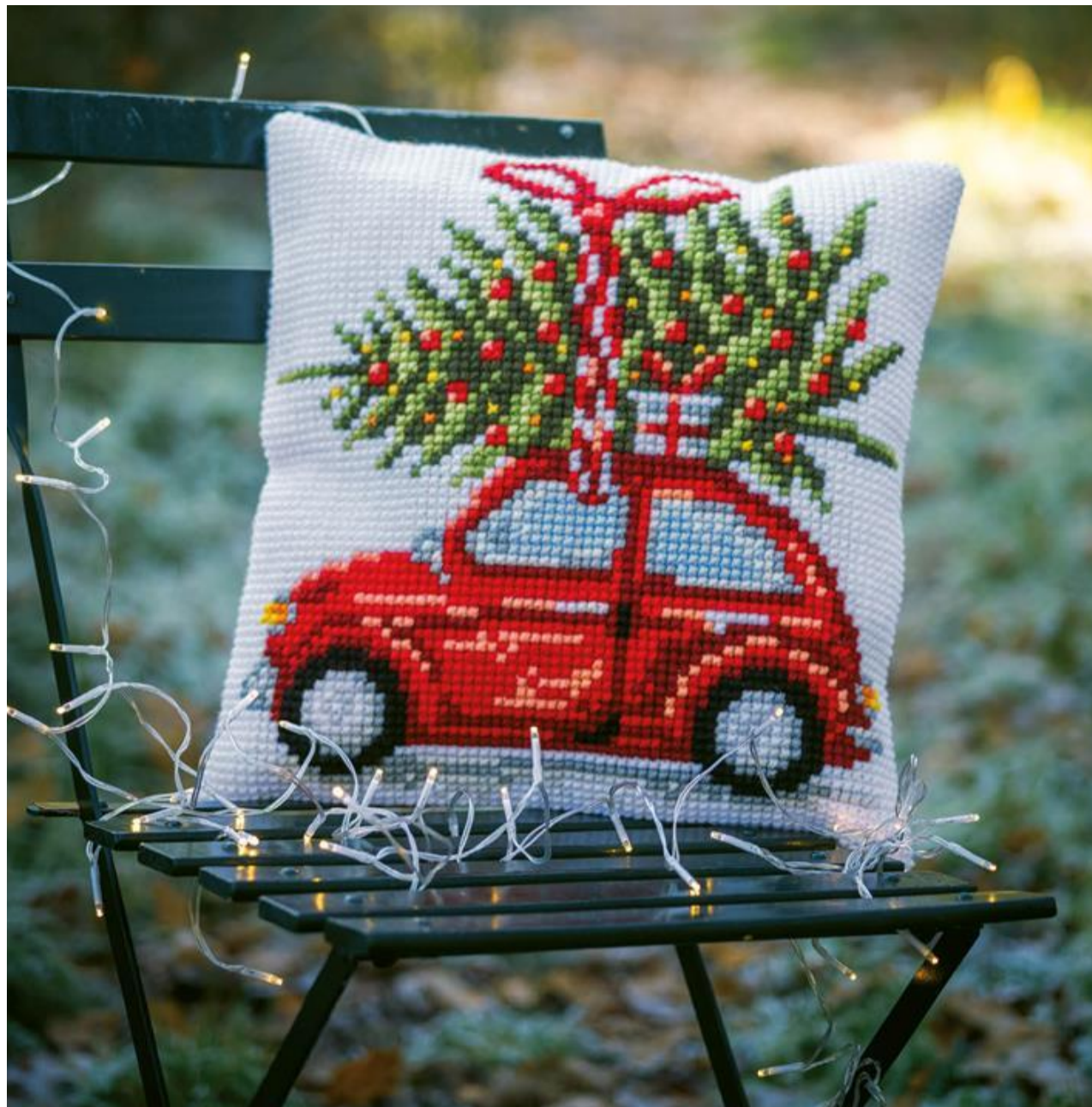
Kit PN0199257 ca. 40x40 cm, Canvas 1,8 100% cotton, Thread: 100% acrylic,