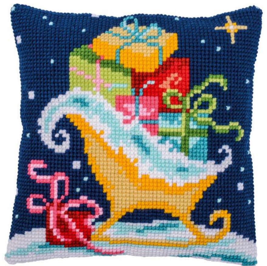
Kit PN0206951 ca. 40x40 cm, Canvas 1,8 100% cotton, Thread: 100% acrylic,